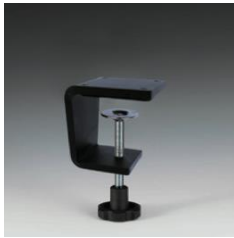
cod. CLAMP.04 Metallic clamp