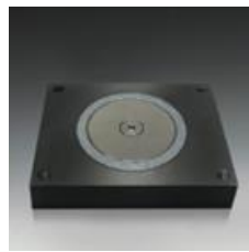
cod. B02 Metallic magnetic base Dimensions 60x60x15mm